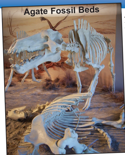
Agate Fossil Beds

Agate Fossil Beds National Monument is located 32 miles north of Mitchell. Fossils from the site, which date from about 20 million years ago, are among some of the best specimens of Miocene mammals. Hikes from one to three miles allow the opportunity to explore the natural