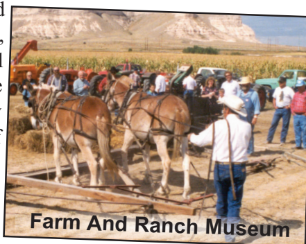
Farm And Ranch Museum