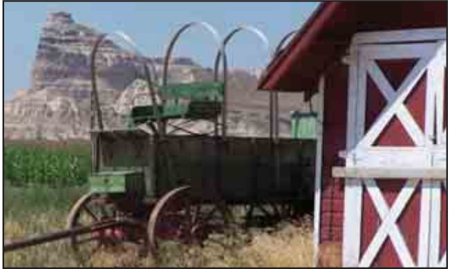
Scotts Bluff which is a natural promontory rising 4649' above sea level.

Centrally located within these fertile acres in Western Nebraska are Scottsbluff, Gering and Terrytown. These cities are separated by the North Platte River - Scottsbluff on the north side and the cities of Gering and Terrytown are on the south. Scotts Bluff County also includes the cities and